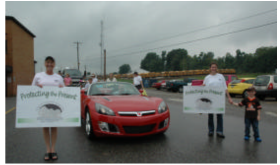
Protecting the Present