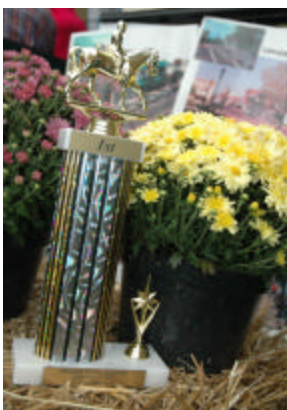
First Place for Parade Float