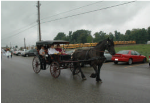
Preserving the Past