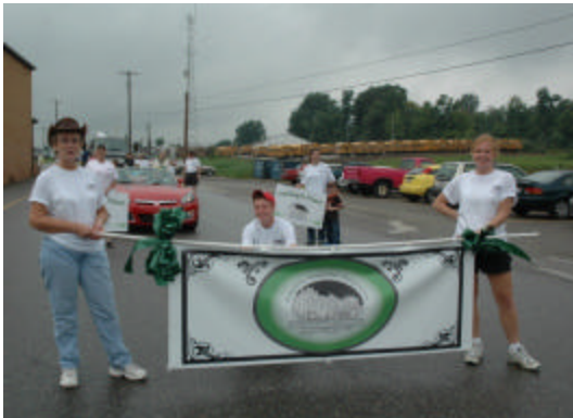
Revitalization Committee Banner