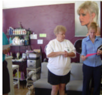
Best Little Hair Hut in Mantua