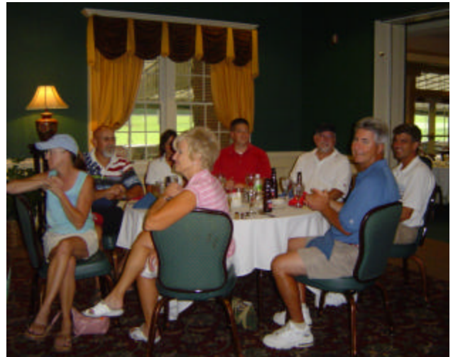
Some of the Dinner Attendees

Also a big thanks to the following businesses for providing door prizes: Aflac, Art N' Flowers, Best Little Hair Hut in Mantua, Better Bumper, Carlton Harley Davidson, Chase Bank, Cortland Banks, Eagle Creek Growers, Flower Nook, Grandview Golf Club, Mantua Station Drug, Middlefield Bank, Singleton Reels, Weiskopf Industries, and Windmill Lakes Golf Club.