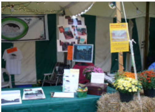
Chamber and Revitalization Committee Booth at Festival Slide show was a major attraction