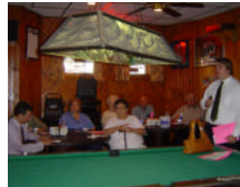
Village Tavern & Restaurant

After the tour, the members and guests hopefully shared what they learned with their family and friends.