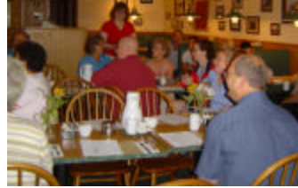
Betsy's Side Street Café & Grille

On Wednesday, June 20, Chamber members and guests met at Betsy's Side Street Café for coffee and a brief business meeting. Following the meeting, the members and guests toured several businesses for a brief overview of their services.