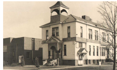
The original Shalersville School

The Shalersville School Historical Committee is collecting Shalersville School pictures and stories to be used to celebrate the school's history as it prepares to close in May. Anyone with pictures and/or stories they wish to share about the school can drop them off at the school between 9 a.m. and